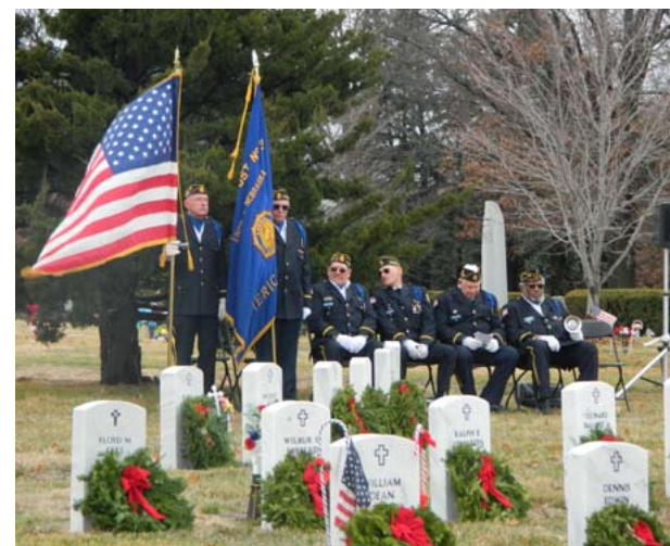
Members of the American legion at the Wyuka Cemetery in Lincoln.

For more information about Wreaths Across America you can go to www.wreathscrossamerica.org .