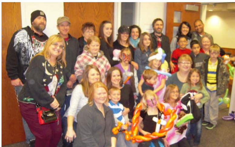
When Lincoln held its 8th annual adoption day on Dec. 1, 61 children found forever homes with 36 families. Lincoln's adoption day festivities were held at the Justice and Law Enforcement Center.

More than 125 foster children were adopted in special ceremonies across the state in November and December. During these special ceremonies, courts open their doors to finalize the adoptions of foster children and celebrate the families who adopt and all who have helped them on their journey to adoption. National Adoption ceremonies were held in Fremont/ Dakota City/Columbus, Grand Island,